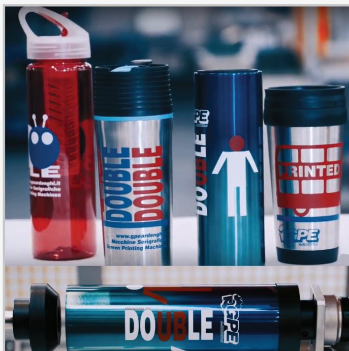
POSSIBILITA' DI STAMPARE UNO O DUE COLORI PER VOLTA POSSIBILITY TO PRINT ONE OR TWO COLOURS PER TIME