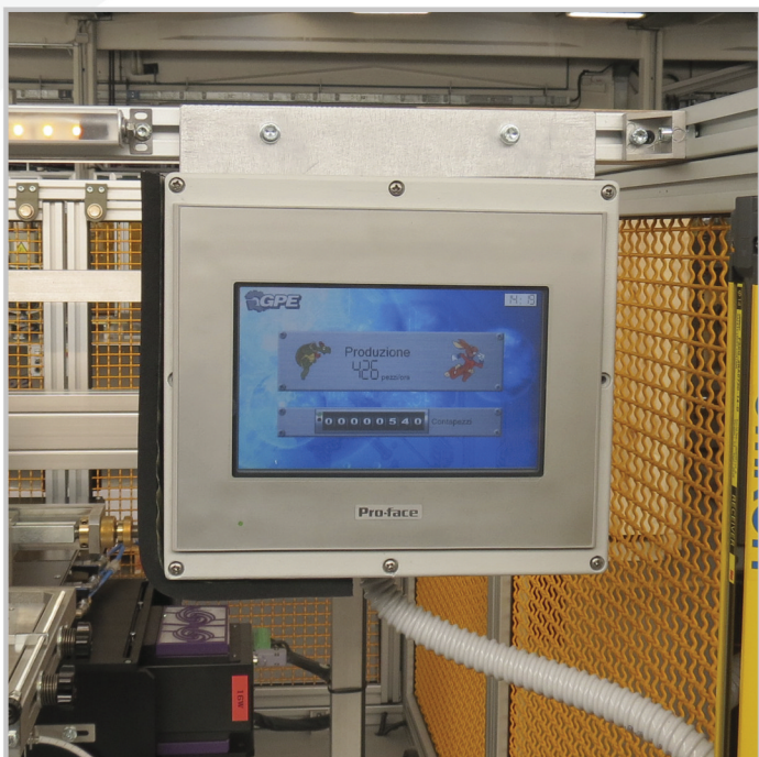
TOUCH SCREEN CON DISPLAY A COLORI TOUCH SCREEN WITH COLOR DISPLAY