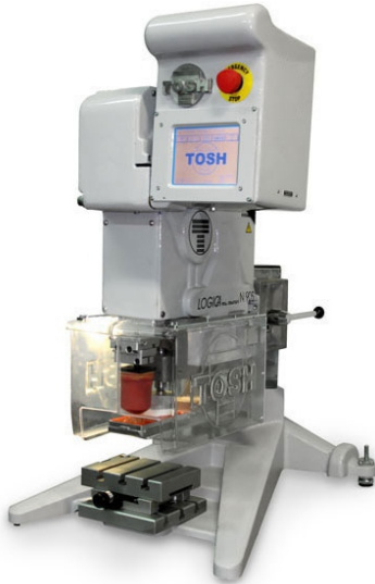
Table Stand Version with optional TO-100 Cross Table.

The “utility knife” of small pad printing machines.