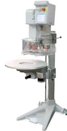
2 color with Floor Stand, T0-100 and TRCN-2S