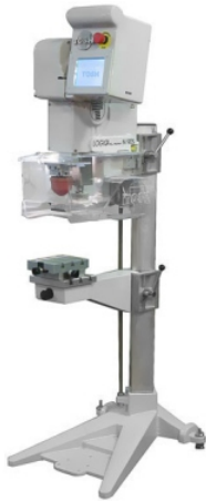
1 color with Floor Stand and T0-100

Below are some popular configurations (in addition to the basic table stand version pictured on the first page of the brochure). These are just some of the potential solutions that the Micro 90 has to offer. Please contact us for information on more complex semi- and fully-automated system options.