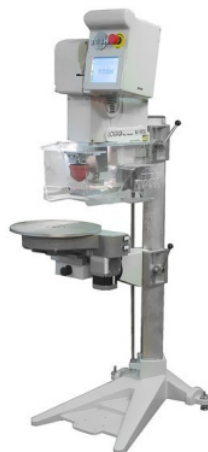
1 color with Floor Stand, T0-100 and TRCN-2S