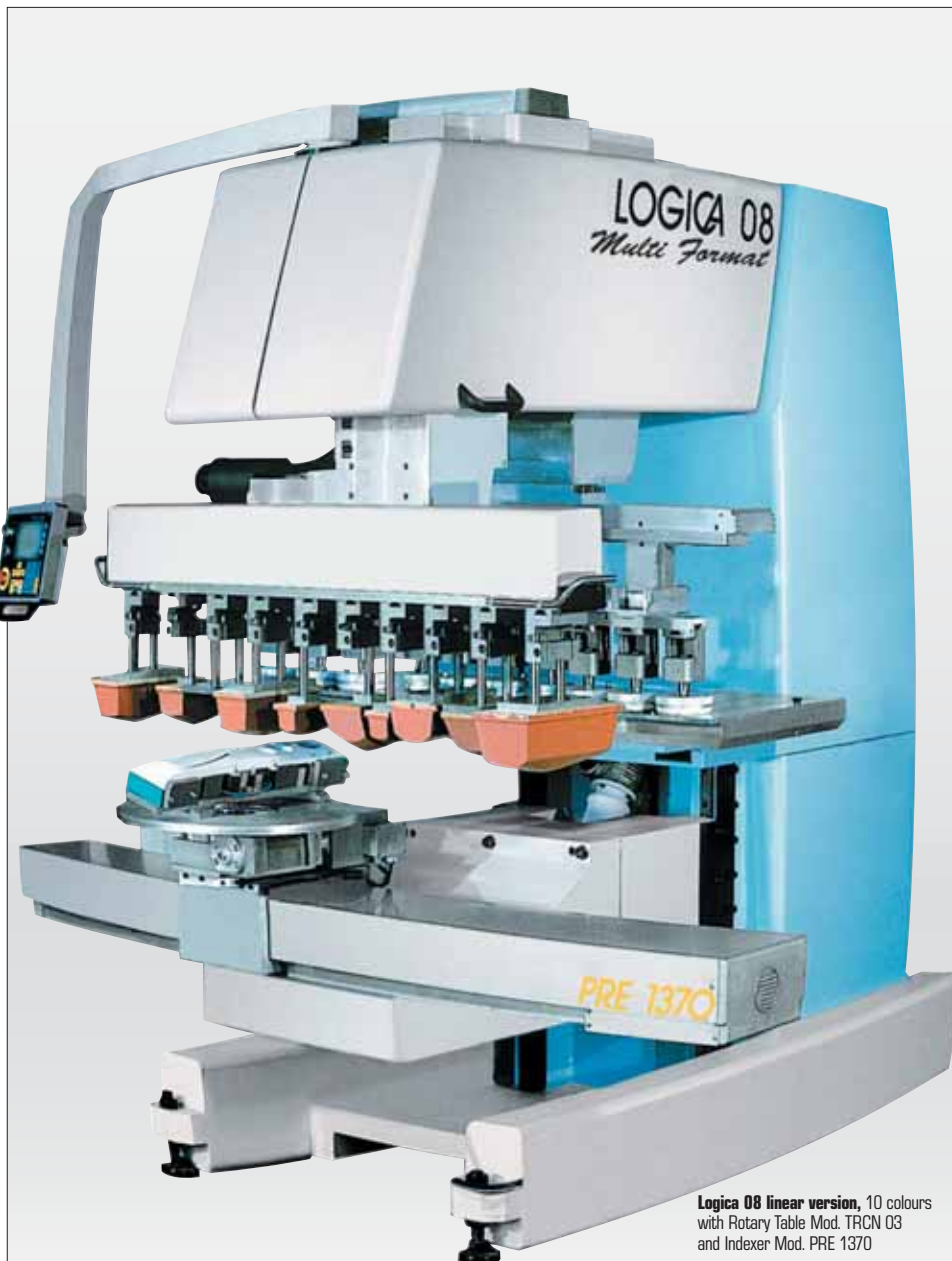
Logica 08 linear version, 10 colours with Rotary Table Mod. TRCN 03 and Indexer Mod. PRE 1370